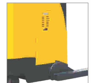
Side battery with roll-out system convenient to replace batteries. The battery upside cover makes you easy to fill the battery.