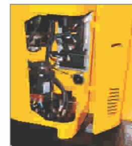
Vertically mounted drive motor with CANbus technology reduces wiring complexity and increase reliability.