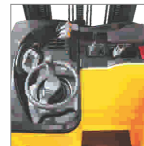
Large cab with dead man power off switch, Multi-function display: battery state, hour meter, fault indicator etc.