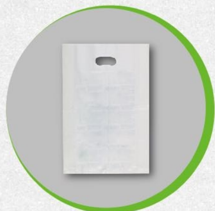
Die Cut Bag