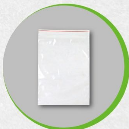
Zip Lock Bag