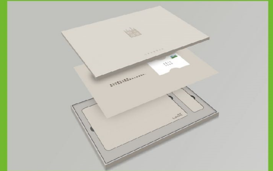
Beautifully packaged with postcards and greetings from the grasslands.