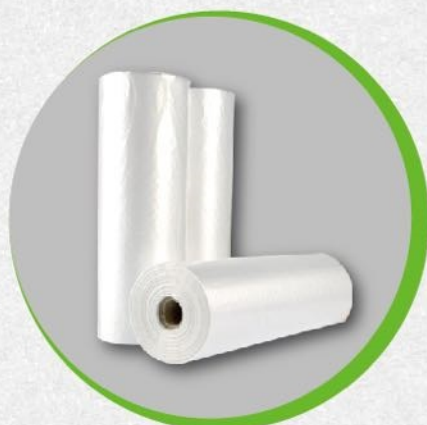
Supermarket Roll Bag