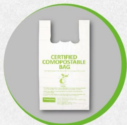
Compostable T-shirt Bag