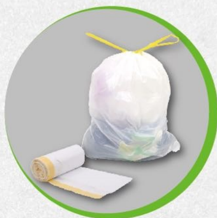
Drawstring Trash Bag