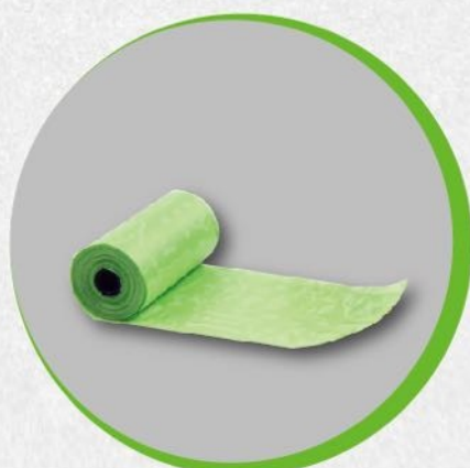
Dog Waste Bag